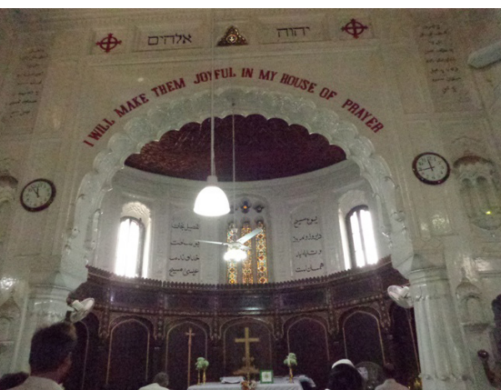
Photos: Inside All Saints Church. Families visit the graves of their loved ones killed from the blasts.