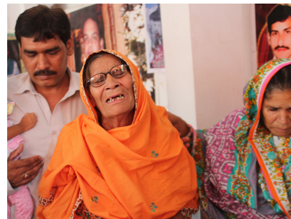
Photos: Inside All Saints Church. Families visit the graves of their loved ones killed from the blasts.