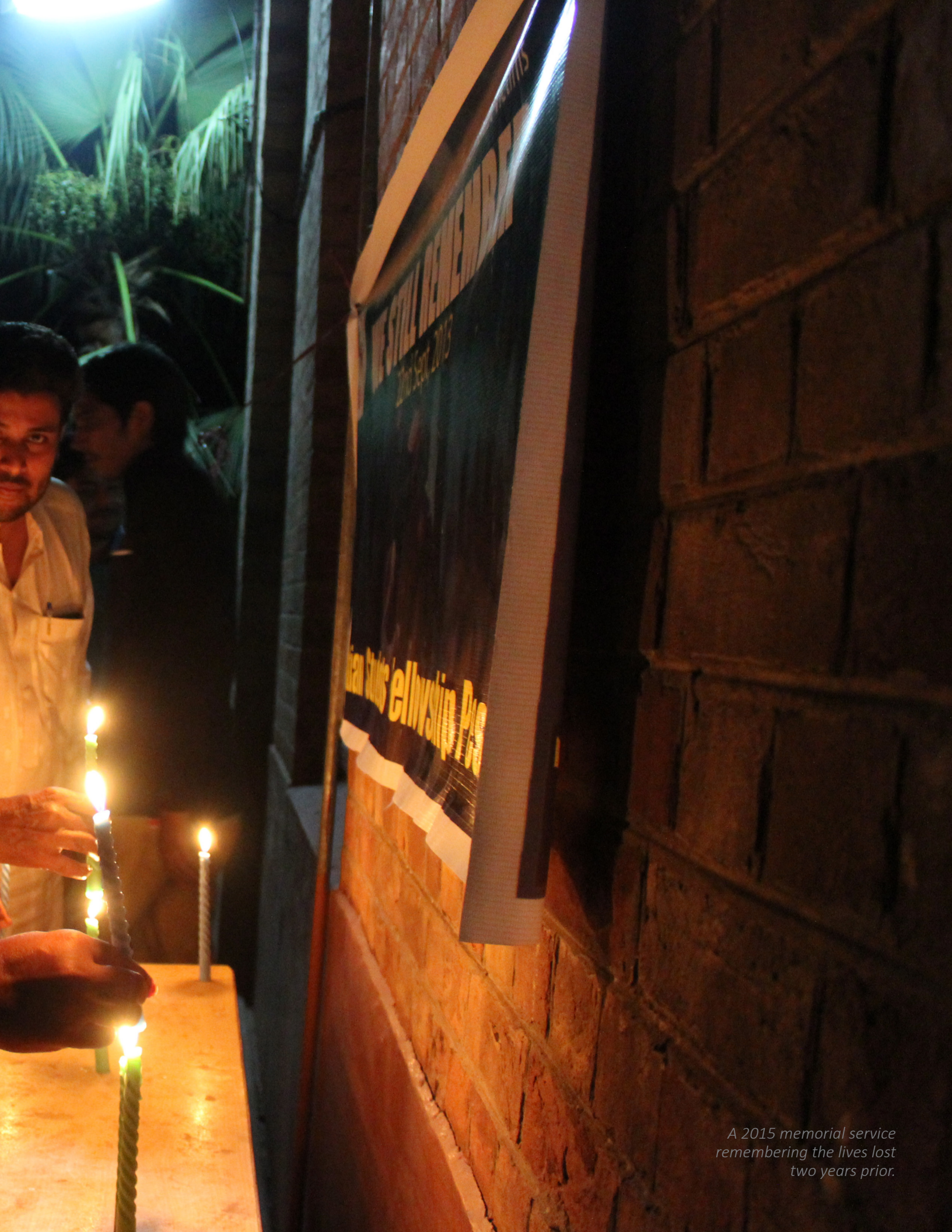
A 2015 memorial service remembering the lives lost two years prior.